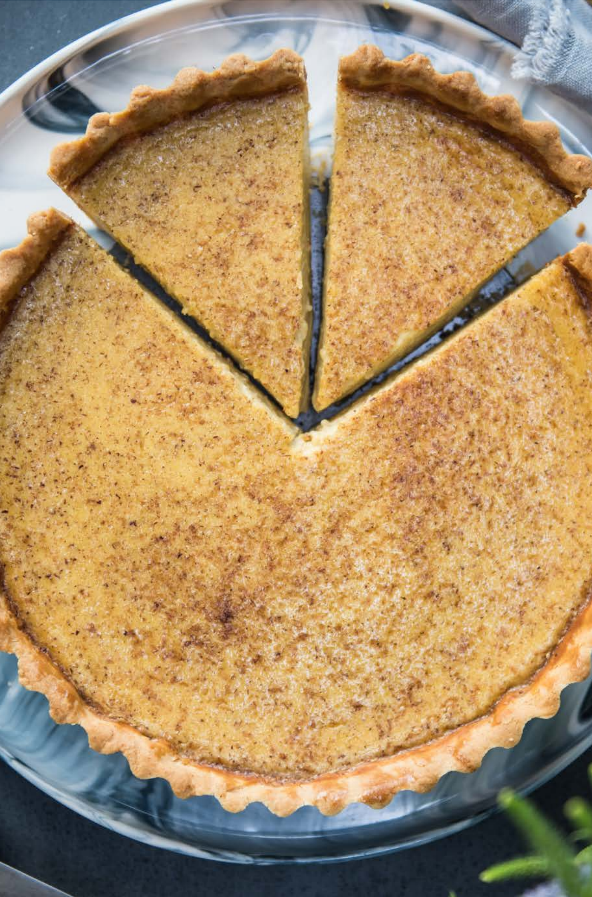
Deep Dish Vanilla Custard Tart