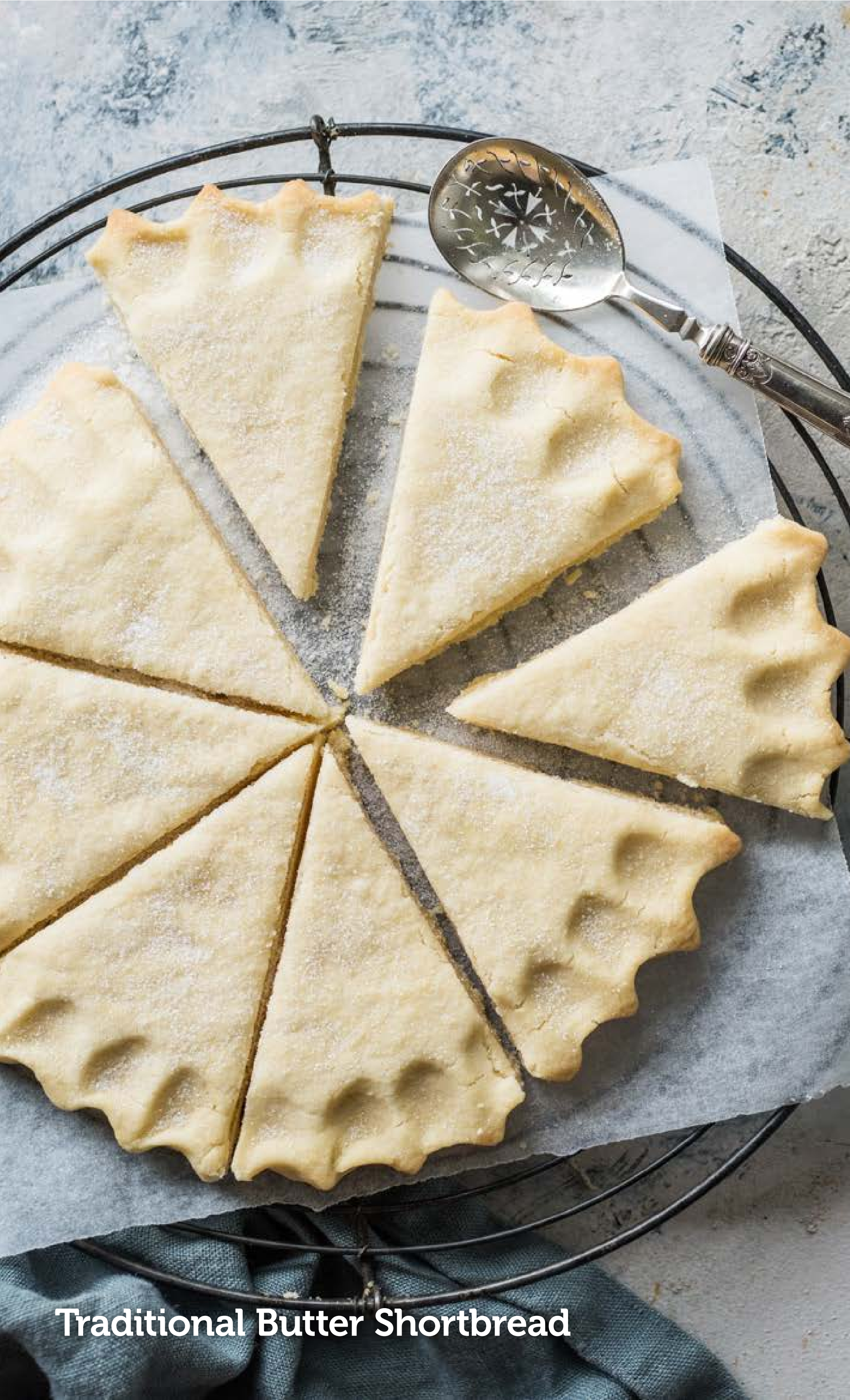
Traditional Butter Shortbread