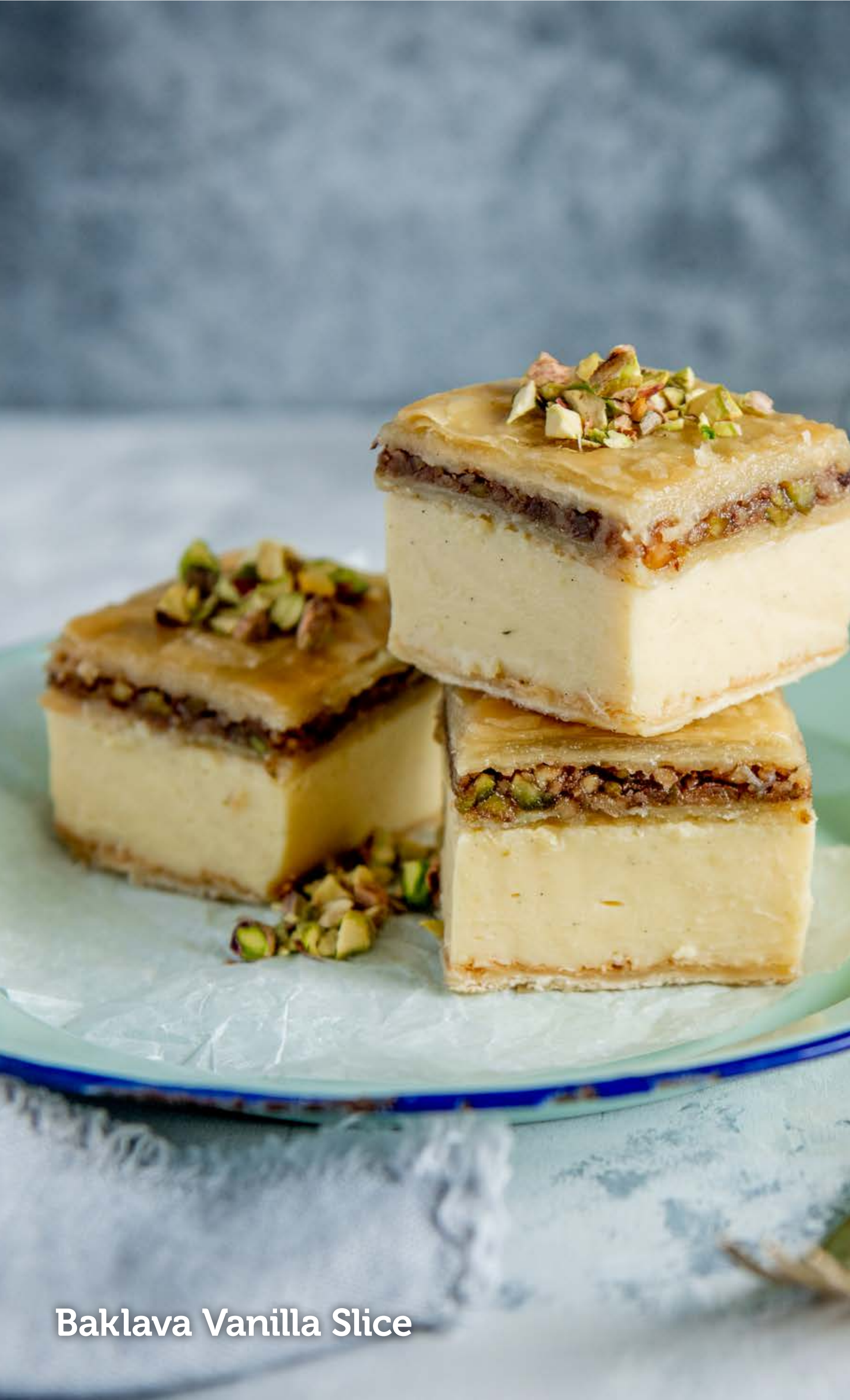
Baklava Vanilla Slice